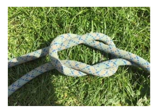
Figure of eight This is used both in climbing to attach a rope to a harness and in sailing as a stopped knot, as it ensures that ropes do not come out of their retaining devices.

Reef knot Making two ends, pass the right end over the left and then pull. Next, pass the left over the right and pull again. This is a good binding knot, as it can be used to join two pieces of rope together or secure the rope around an object.